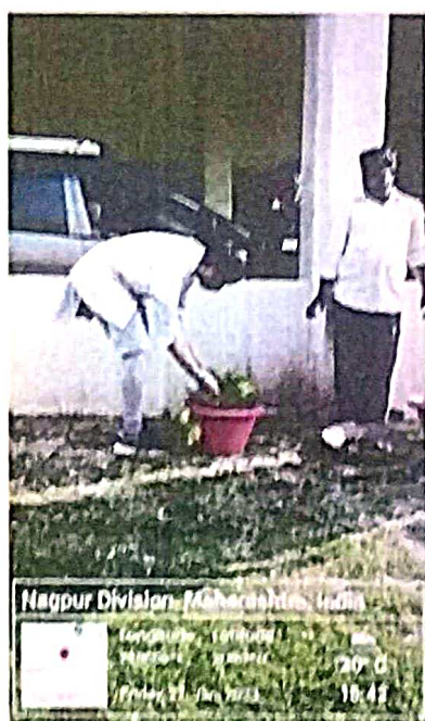
Herbal plantation by students