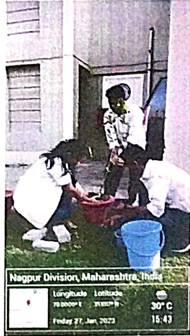
Herbal plantation by students