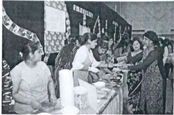
Judge observing fete competition