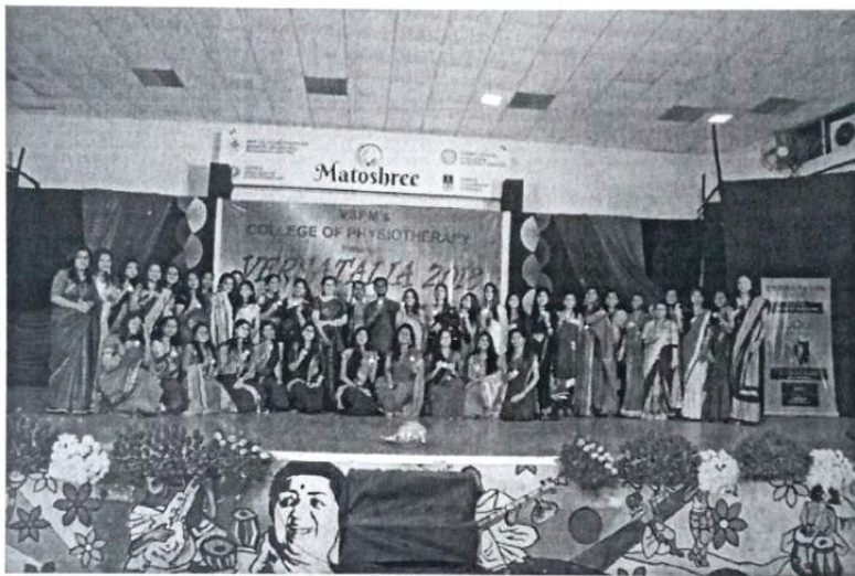
Felicitation of students