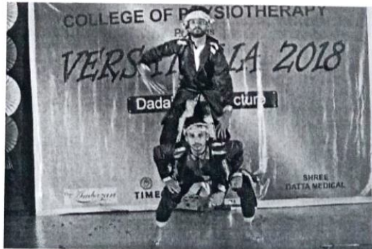
Singing, Dance and fashion show by students