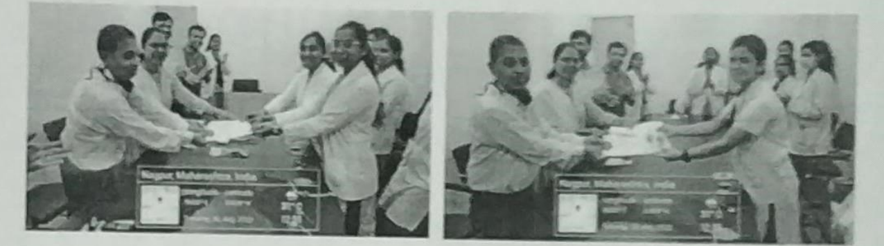
Distribution of certificates to winners