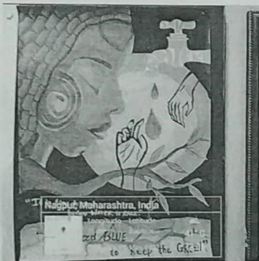
Poster of 1 st winner