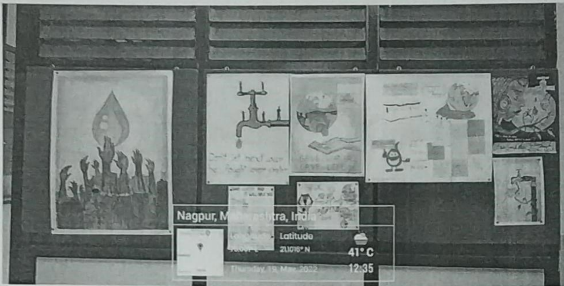
Posters of participants display on board